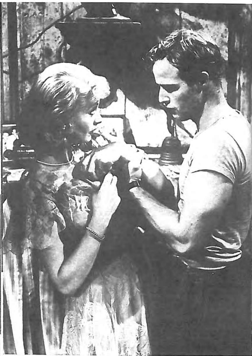
Vivien Leigh as Blanche and Marlon Brando as Stanley in the distinguished 1951 film version of Streetcar , directed by Elia Kazan for Warner Bros. The film won "Best Performance" Oscars for Vivien Leigh, Karl Malden and Kim Hunter.